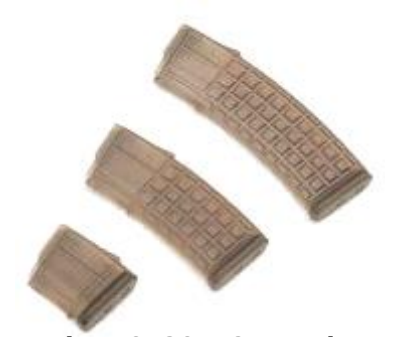
Magazine 10, 30, 42 rounds