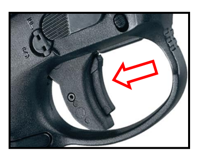
Safety Condition 1 Automatic Trigger- Drop-Firing Pin Safety Mechanism. In this condition the pistol is safe until the moment the trigger is pulled.