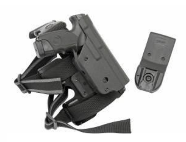
Tactical Holster set for L-A1 and M-A1