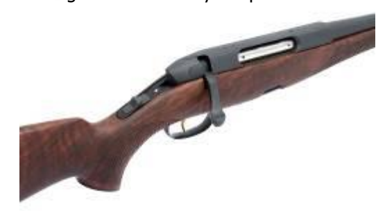
The weapon is in safe posistion. A set trigger is automatically unlocked

The ergonomic and easy to operate hand cocking system (H.C.S.™) sets new standards for all hunting situations.