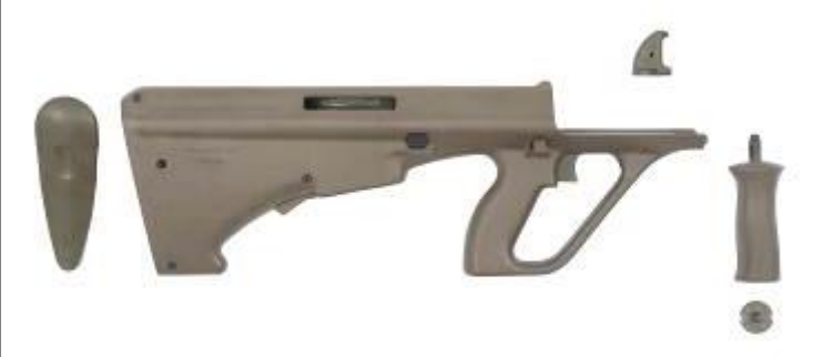
Conversion kti olive for STEYR AUG Z (not for A3 versions!)