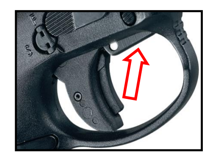
Safety Condition 2 Optional Manual Safety. Can be activated manually, according to the user's needs. The safety catch can be quickly deactivated by the trigger finger.