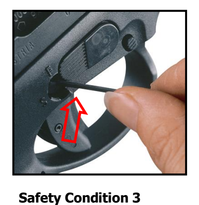
Integrated limited access lock with key. The integrated locking function is

The integrated locking function is activated by a key and prevents firing and dis-assembling of the pistol.