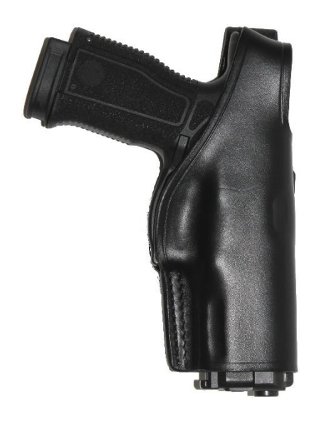
Holster G-Man (1-HW-62366)