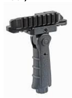
Railsystem with foldable grip