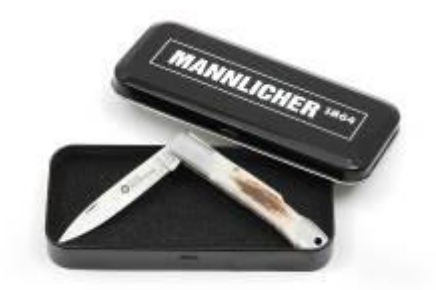
Knife SCOUT SURVIVAL