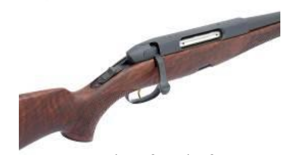
The weapon is ready to fire, the firing pin is cocked.