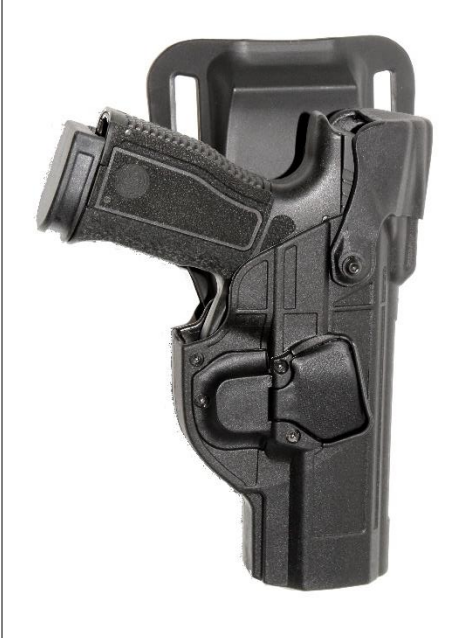
Holster King Cobra COP Level 3 (1-HW-62474)