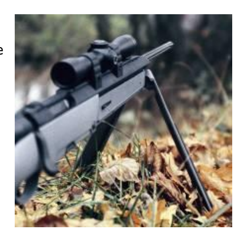
The bipod integrated in the foreend stock can be deployed when needed.

The stock features a spare magazine in the butt stock. The receiver includes flip-up emergency sights.