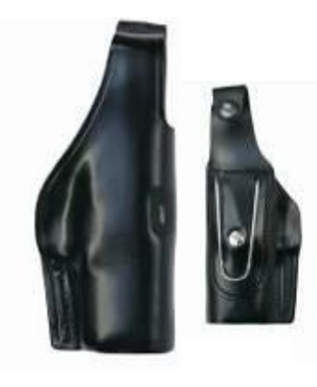
Left: with clip