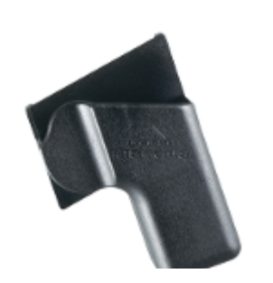
Synthetic holster PISTOL M&S Series