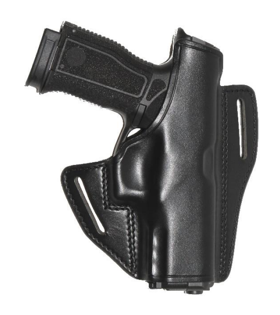
Holster Lightning (1-HW-62367)