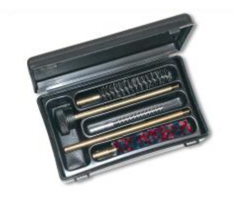
Cleaning Kit STEYR PISTOL M-Series

Conventional Sights with tritium inserts